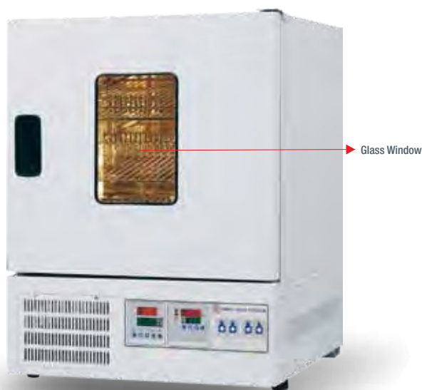
▲ 12580 / 125570