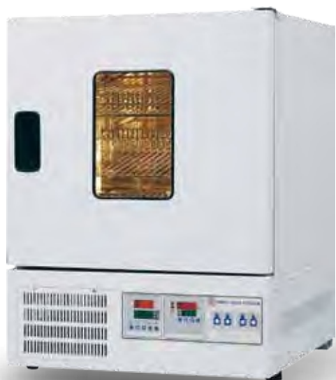
▲ 12580 / 125570