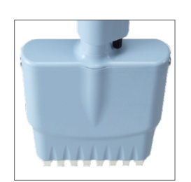
Reduced the weight up to 30% Reduced fatigue for pipetting compared with the conventional products