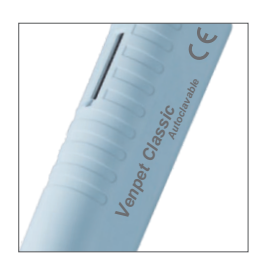
Material used for pipette body have high tolerance to solvents. Non-Grease designed no

need to worry about continuous autoclaving.