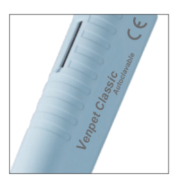
Material used for pipette body have high tolerance to solvents and to drop impact . Non-Grease designed no need to worry about continuous autoclaving.