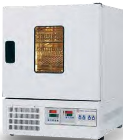
▲ 12580 / 125570