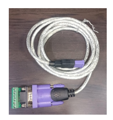
Accessory Data Transfer Cable

info@venchalscientific.com www.venchalscientific.com