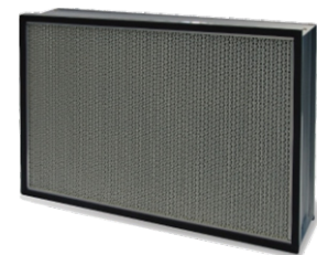
Optional : ULPA Filter 99.999% W ISO Class 4 (Class 10)