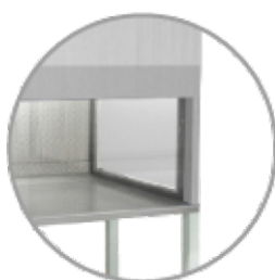
Optional : Glass Structure tempered safety glass wall at both sides for observation view